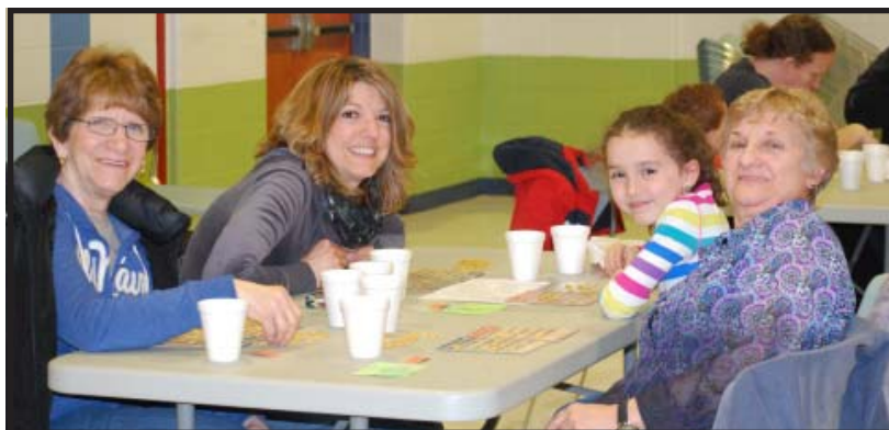
The CW West PTO hosted Bingo Night for families in late winter. The cost to play was a non-perishable food item for the food bank. Prizes included donations from local businesses.