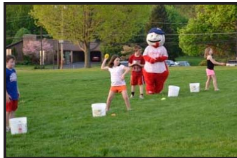
Screwball gives some pitching advice to CW East students during Family Fun Night in May. The Fenway Foul-Up, the first in a series of ten ballpark mystery books, was chosen as the One Book, One School project and 250 people took part in baseball and reading activities, courtesy of the PTO and a United Way grant.